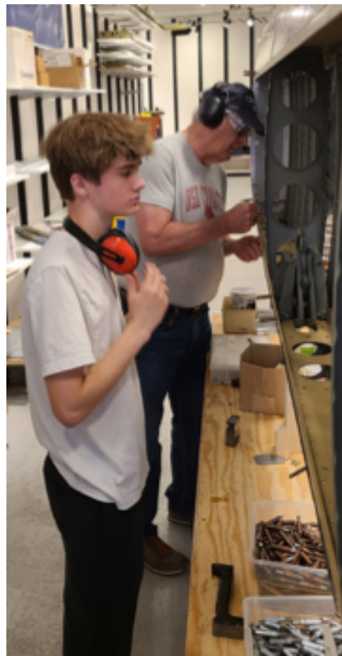
Progress Photos: EAA 80's Glastar

Glastar Build is every Sunday 1 to 5 at the Oakview Mall. Volunteers of all skills and ages are welcome.