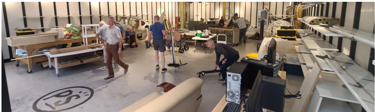
The new bay-all moved in!