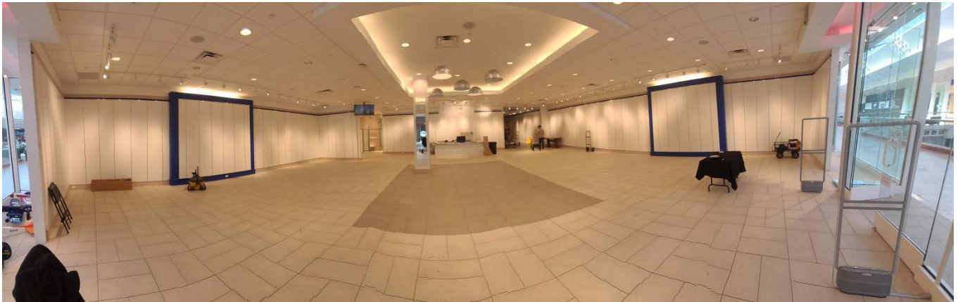
The old bay-cleaned out.