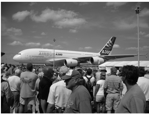
← Airbus A389. The worlds largest civilian airliner. The double decker can carry 850 passengers.