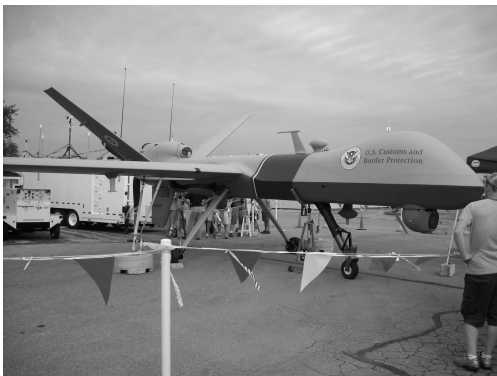
← Predator UAV. Is this the future of aviation. You need a Class 1 Medical and commercial license to fly these from a computer console.