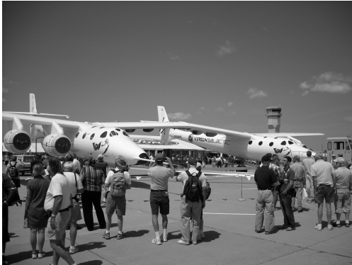
← Whiteknight Two (WK2). The largest all-composite aircraft ever built. Another Rutan wonder.