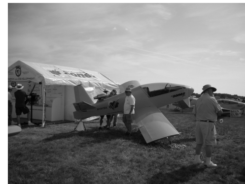
← Sonex jet. This is the smallest jet power aircraft I could find at Oshkosh.