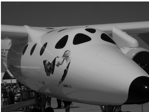
← The left fuselage of the WK2. Yes, these windows are painted on to give it the same appearance as the manned right side.